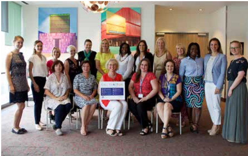
Founding Committee with members from: Australia, Canada, Germany, Ghana, Greece, Hungary, Ireland, Lithuania, Mexico, Northern Ireland, Portugal, Turkey, Ukraine, USA

GLANCE aims to create, empower and support a global patient voice in each region of the world while taking into account the respective cultural, historical and socio-economic backgrounds and needs of families.